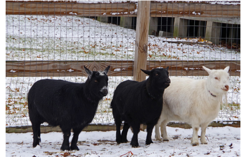
Peggy Carter | 3rd Place Sunset Hill Farm Park

Take photos at Porter County Parks for the upcoming calendar. Submit (up to) three high resolution photos to